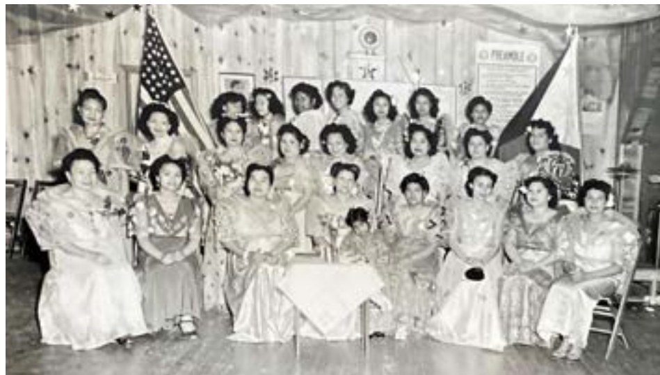
The Filipino American Women's Club was established in 1949. Photos are from their first Installation of Officers on April 17, 1949.